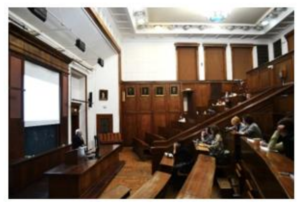
The auditorium named after G.V. Dobrovolskiy

research and education. Classification and evaluation scales of physical properties of soils and soils by N.A. Kachinskiy, based on a generalization of the international systems, his own work and the work of the team, formed the basis for the national classification of soils by granulometric composition, assessment of their density, soil structure, and water conductivity.